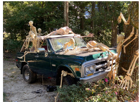
(Halloween decorations in OS)