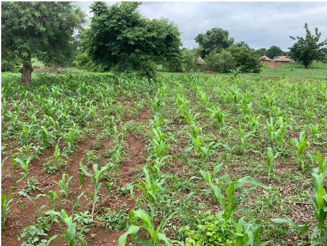
Here one of the local famers adopted our system for half of his field. Lord willing the difference of the two systems will be very clear by harvest.