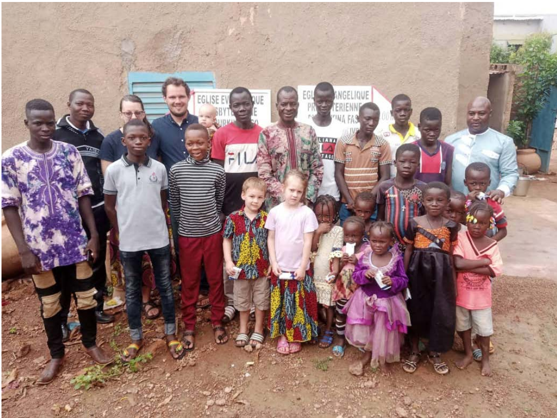
Some of the members of our church standing in front of our newly made signs.