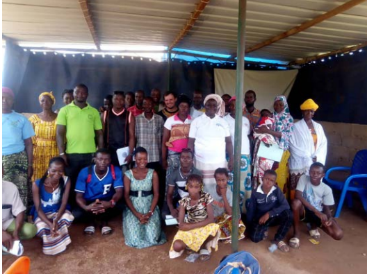
The students from one of our trainings with Foundation for Farming in a nearby village.

Here is what BurkinaInfo presented on the news. (If the video does not play click here )