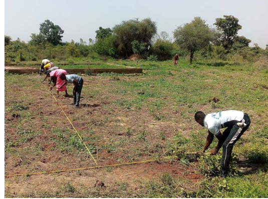
The members of our church measuring and digging holes for planting corn.